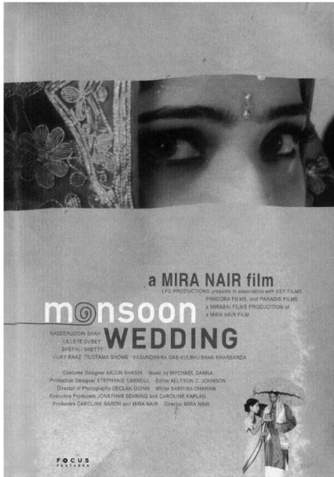
MONSOON WEDDING Monday, March 13 @ 7:00 pm